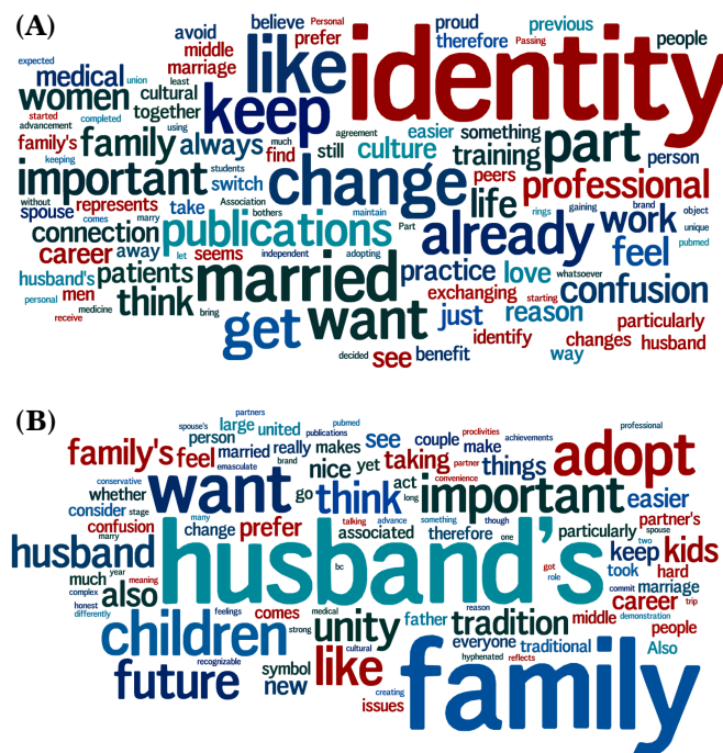
Figure 2. Medical students tended to use similar key words in explaining their preferences.

By contrast, women who wanted to adopt their husbands' names considered their relationships with